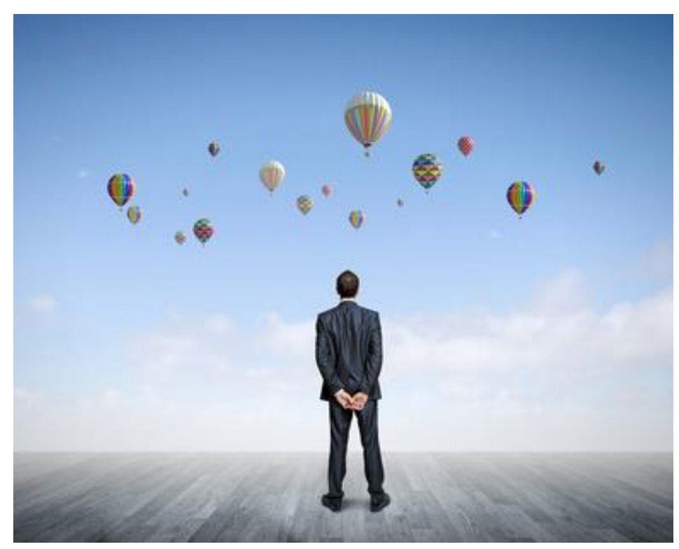
Different ways to send your brand to the top...